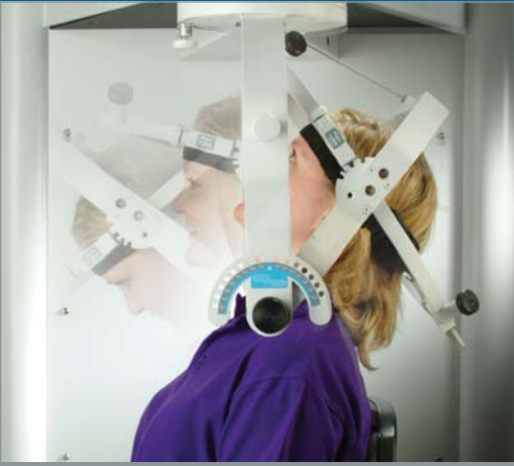
Provide injury specific rehab